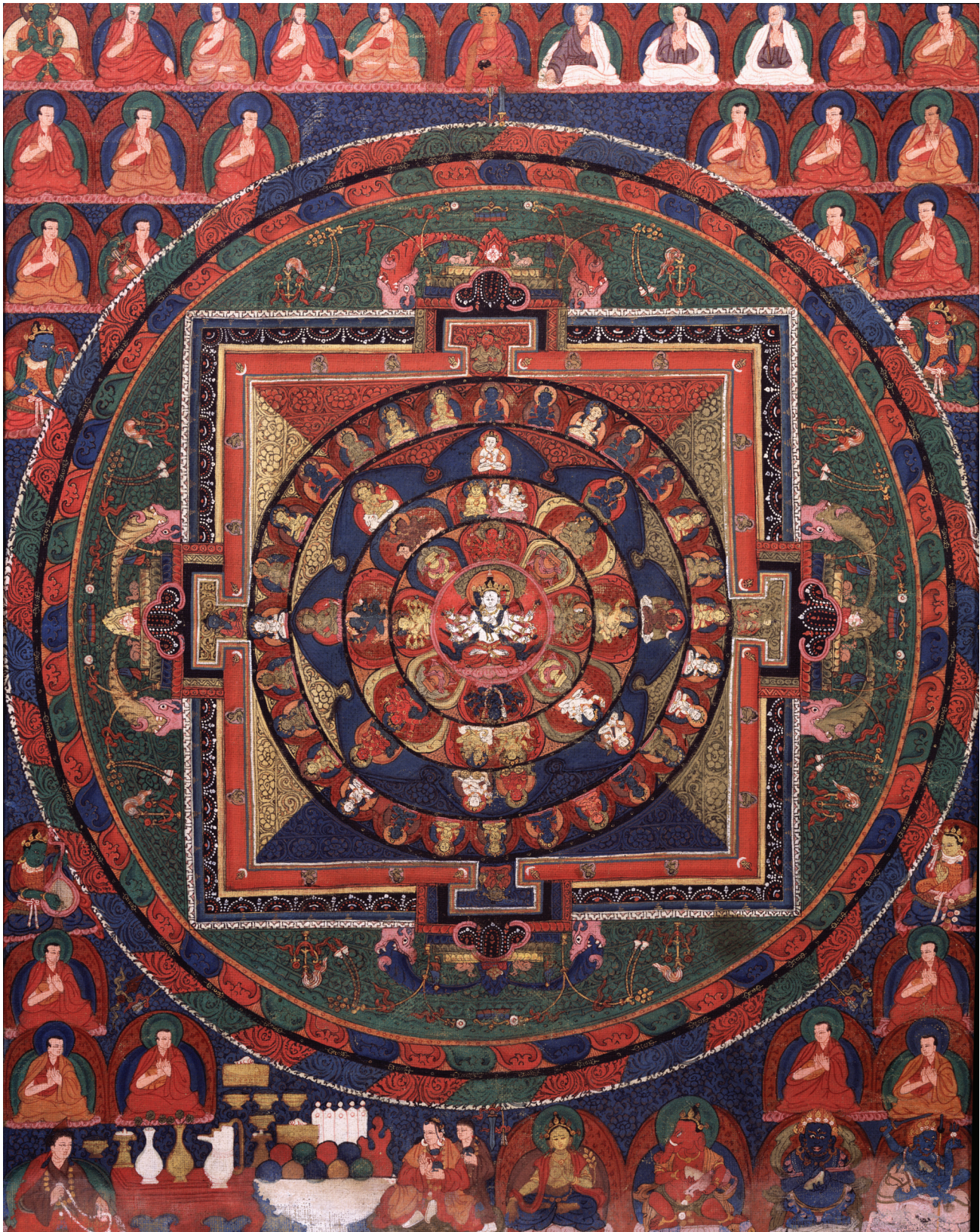
Mandala of Pancharaksha ; central Tibet; 18th century; pigments on cloth; Rubin Museum of Art; C2003.50.6