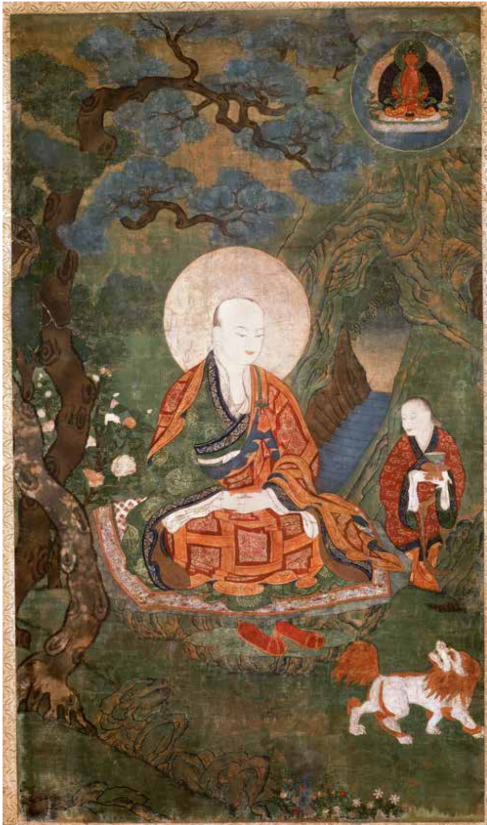
Arhat Ajita; China; Ming dynasty, Yongle period (1402–1424); mineral pigments on silk; 30 x 19 in. (78 x 50 cm); Collection of Robert Rosenkranz and Alexandra Munroe